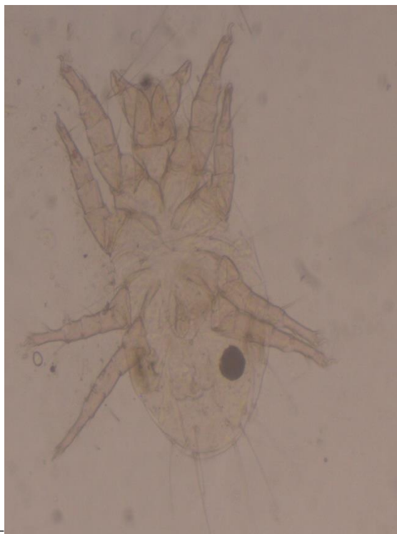
Dermatophagoides farinae Male