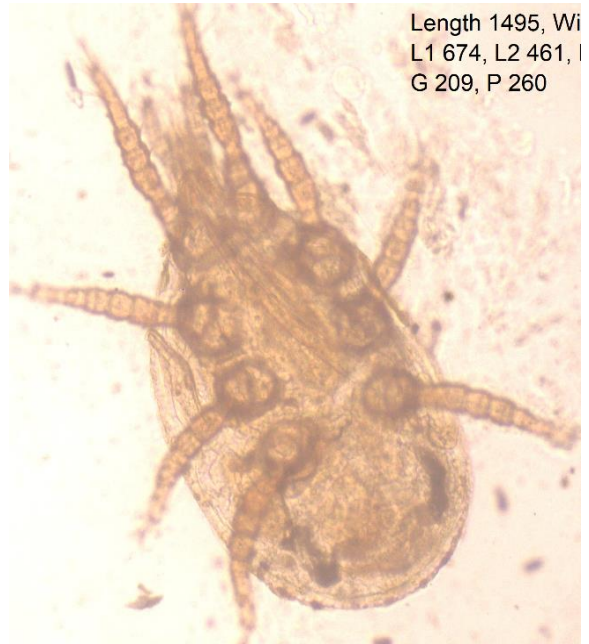
Prodinychus sp. (Deutonymph)