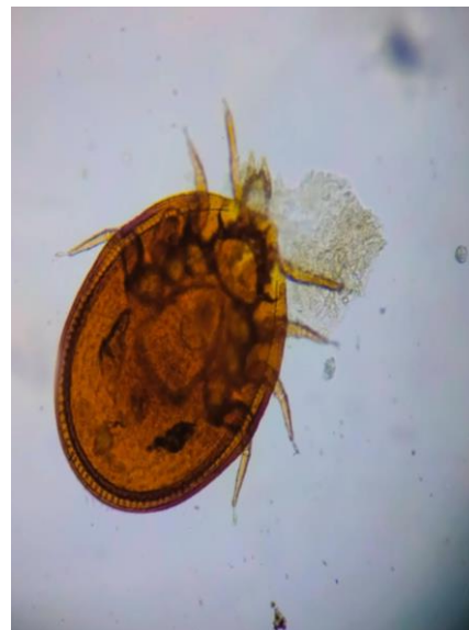
Leiodinychus krameri Female