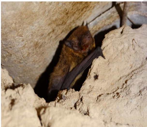
Fig. 1. The Little Indian Bat ( P. coromandra )

Cheiridium museorum (Leach, 1817) is a species with a wide geographical distribution. It can be found in several types of habitats: under stones, under bark, mature dunes, dead leaves and mosses in Abies forest, under bark of Populus trees and holes in Prunus trees with nest of Lasius sp. (Nassirkhani, 2015). It occurs in synanthropic habitats, such as houses, shops, barns, grain-stores, and stables, as well as in the nests of domestic birds, such as house sparrows, pigeons, barn swallows, and house martins (Christophoryová & Červená 2020). It used their pedipalps to capture and seize the prey as well as to grip and hang on the furs of bats. This pseudoscorpion species was found only to be associated with those bats that were heavily infested with ectoparasites (Argasid ticks). No specimens were recorded on bats that were not infested with ectoparasites.