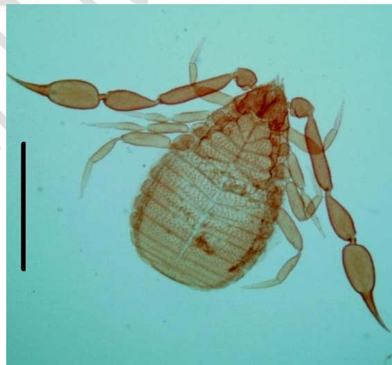
Fig. 2. Cheiridium museorum (Leach, 1817) collected from the pelage of P. coromandra Scale bar: 1 mm.