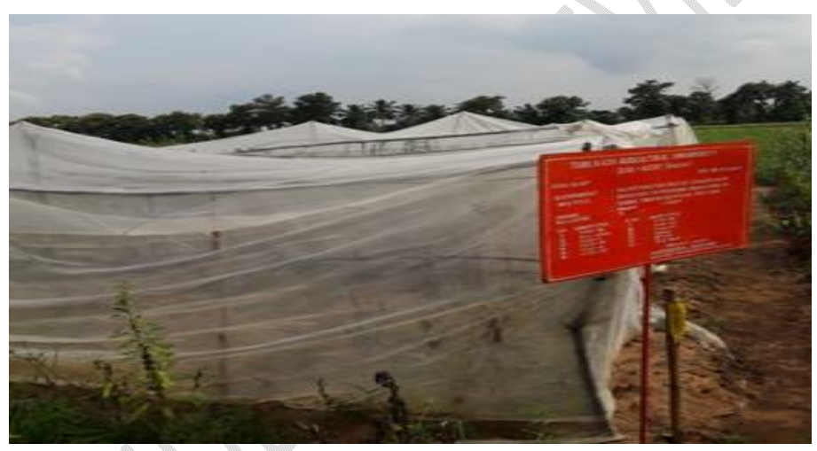
Fig .1. Screening of promising entries against Antigastra under artificial pest load Comment [vb22]: change to A. catalaunalis condition