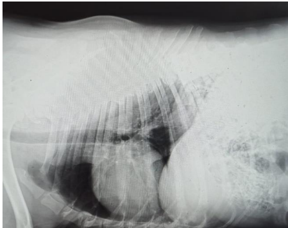
Figure 1: X-ray of Dog (Enlarged Heart) Veterbral Heart Score(12.5v)

The elevated cardiac-specific troponin I (cTnI) was 0.39 ng/ml in serum concentration , exceeding the normal reference value 0.05-0.24 ng/ml [16]. X-ray imaging (right lateral view) revealed cardiac enlargement, with a vertebral heart score (VHS) of 12.5v, exceeding the