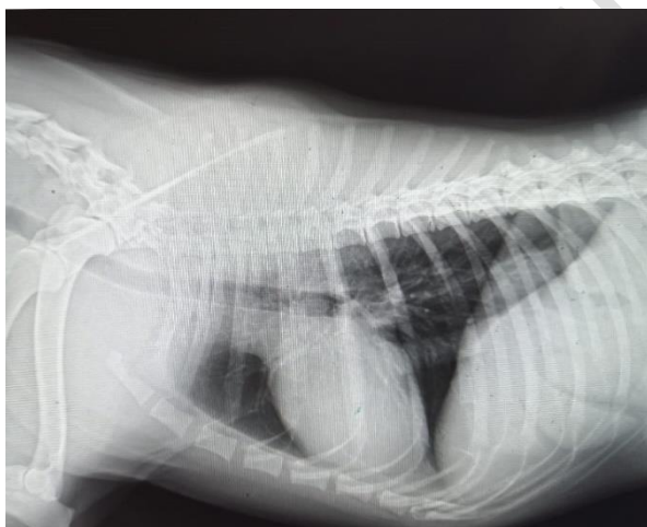
Figure 3: X-ray of Dog (Heart Size Returns to Normal) Veterbral Heart Score (10.5v)